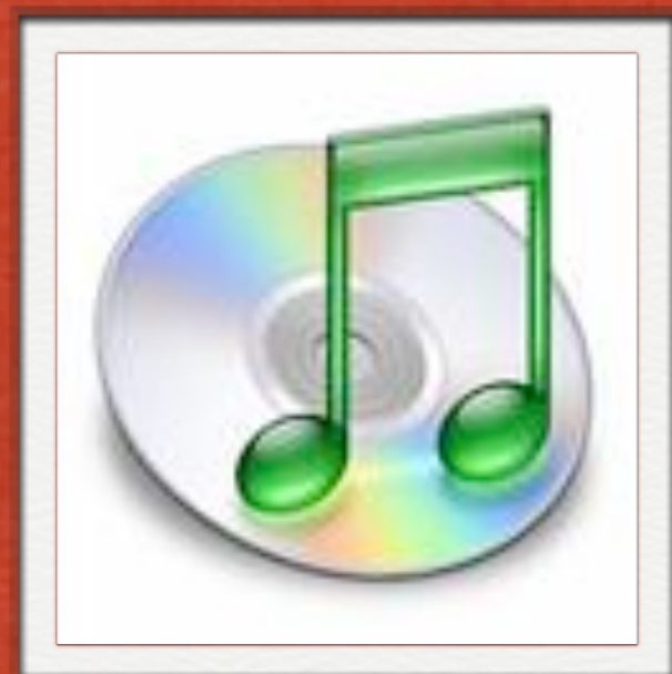
• iTunes logo